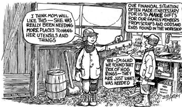
Memories Of A Former Kid. MugWump Marketing (507) 645-7999