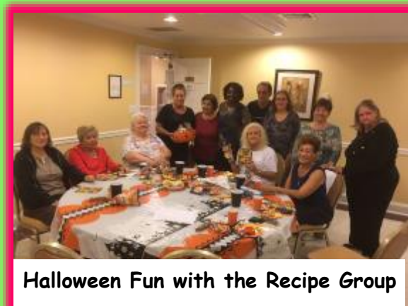
Halloween Fun with the Recipe Group