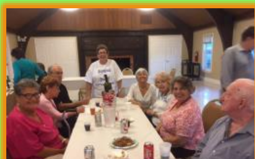
Latino Group Celebrates 1 Year