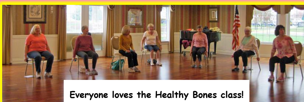
Everyone loves the Healthy Bones class!