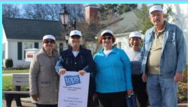
Members from TOPS on "National Walking Day"