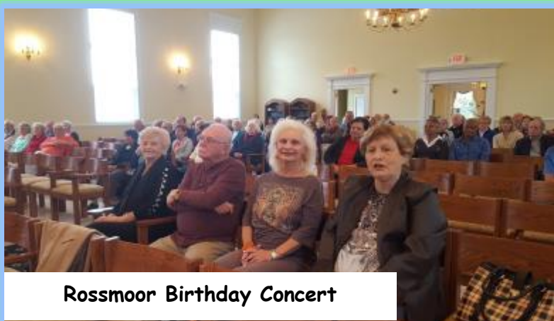
Rossmoor Birthday Concert