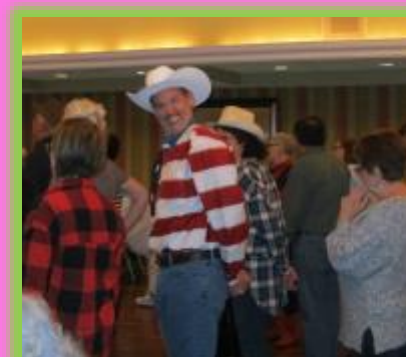
Feeling a bit patriotic during Country Western Night