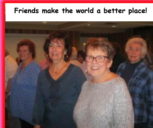
Friends make the world a better place!